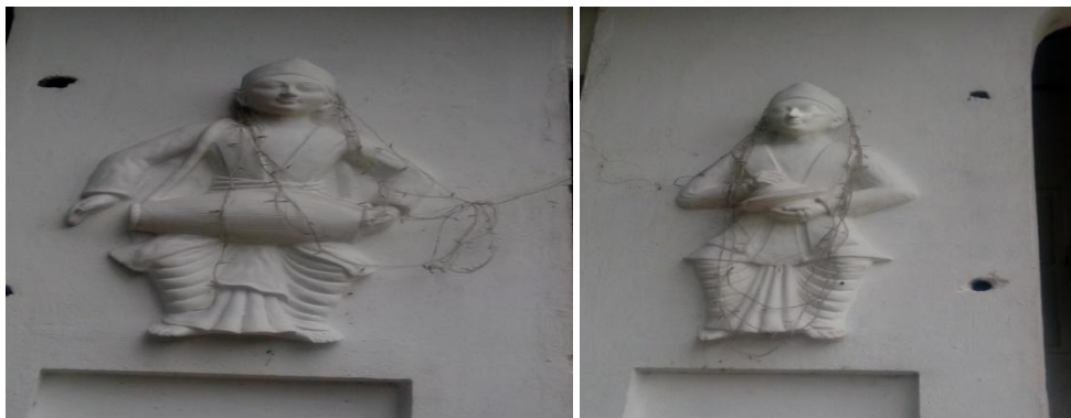
Fig No. 4 Glimpses of Kirtan of Satsang