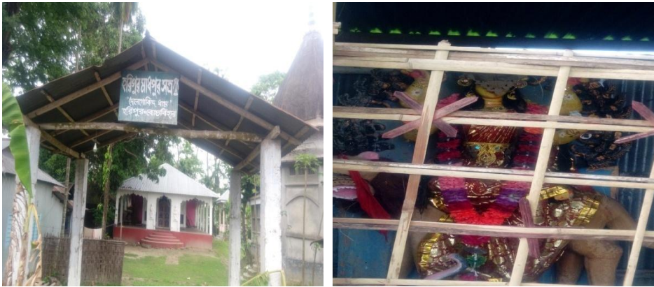
Fig No. 2 Hindu Hari Mandir